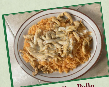
1/2 Arroz Con Pollo