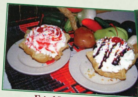
Fried Ice Cream