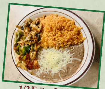
1/2 Fajita Chicken